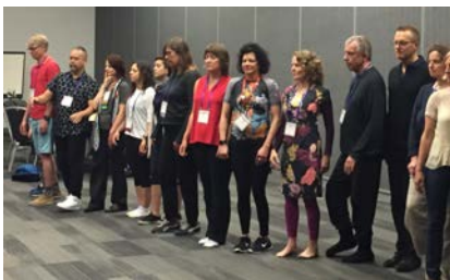
Figure 1 Pictures from CHI 2016 workshop