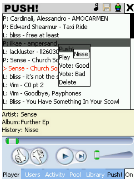
Figure 1. The Push!Music interface.

After the current song has finished playing, the songs from the pool are automatically played one after the other in the playlist. While a song is playing, a history list of the most recent ‘owners’ of this song is displayed in the interface.