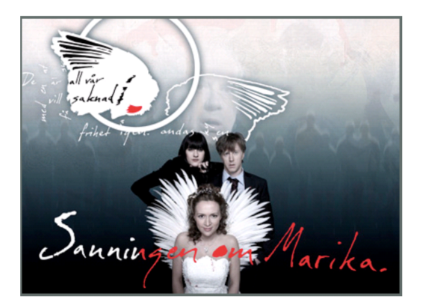
Figure 1: Screen shot from the SVT site from Sanningen om Marika.

Sanningen om Marika spanned several media types. The creators called it a "participation drama", indicating the intent to get the audience to actively participate in the story line. The core components were the TV series, a current affairs debate program recorded weekly, and a website called Conspirare . The TV series provided a hub for the storyline and offered passive spectating. The Conspirare