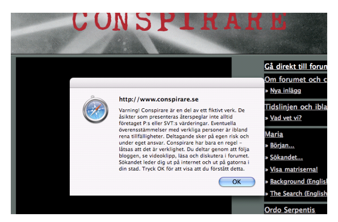
Figure 4. The pop-up warning message at Conspirare.<sup>5</sup>

play in smaller groups. Mission documentation (video and photos) was uploaded to FlickR or YouTube and announced on Conspirare . Participants could also submit their documentation to SVT.