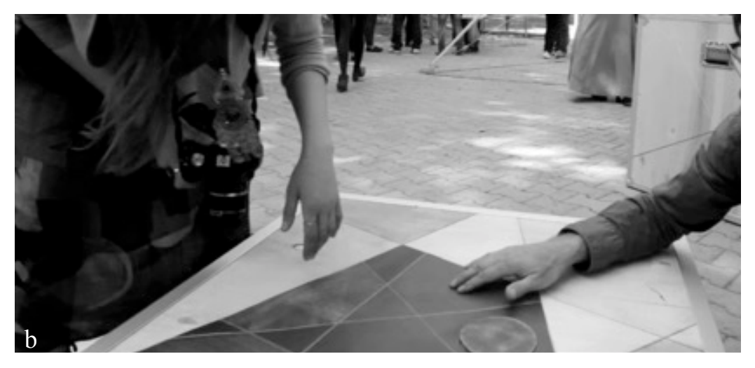
Fig 1. Leather used as a surface material for the touch-sensitive input surface of the sound box . The sensory experience of touching leather invited for gestures of gently touching and stroking, which played a significant role in how the touch-sensitive input surface was approached and interacted with.