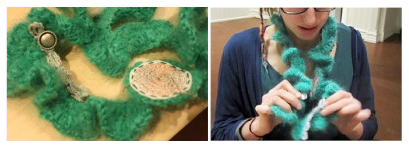
Fig 2. The use of textile and soft materials guided the way the Speaker Scarf has been designed, in particular the specific physical manipulations that need to be performed in order to listen to the music. Left: the textile speaker unit and the on/off switch that can be also used for adjusting the volume. Right: Adjusting the volume by placing a metallic button on one of the loops made of resistive yarn.

loop made of resistive yarn, and similarly, by inserting the metallic button in one of the other loops, the volume can be adjusted.