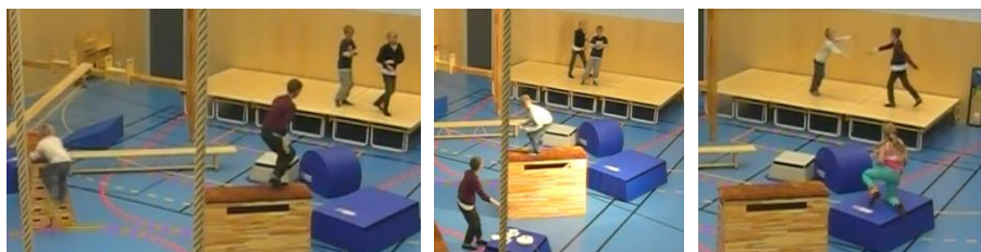
Figure 5. (Left and middle) Fruit kids keeping an eye on the weather gods before and while a flash, and (right) fruit kid becoming aware of the game situation by the loudness of movement from the weather gods.

Generally throughout the sessions both weather gods and fruit kids focus was observed to be mainly on the personal and near space but how the children spoke of their opponents in the game also shows how they did have a connection to the environment, that the interaction with the technology did not hijack their focus from being aware of their surroundings. Sound announcements from the speakers as well as noise from large movements on stage, did also alert the players to look up and observe the other team.