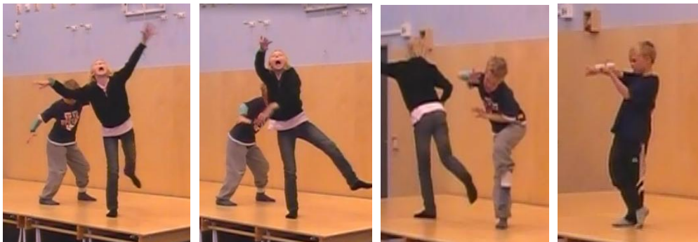
Figure 3. (Left and middle) Weather gods getting into the groove of moving, acting out with the whole body, and (right) aiming with the whole body to shoot a flash.

While on stage, some weather gods were seen making weird, tricky and complicated movements involving the whole body from snaking with the head, twirling their fingers around and letting the experience be seen also in their facial expressions (see Figure 3). One pair doing the robotic dance made 'sch-sch' sounds to go with their movement, when trying to get into a rhythm. The freedom space in the game context seemed to allow for the children to tailor their own individual experience of really getting into the movement. This embodied experience was also shown in how many gestures and actions were exaggerated, for example the sending off of a 'flash'. The action was described as pushing a button on the Wii Mote, but on stage during the game the weather gods were seen to be in a more embodied state with not only pressing the button, but instead using their whole body to aim with the arm fully stretched out forward from the shoulder. Some were even squinting with their eyes as if looking through a riflescope to aim the flash (see Figure 3).