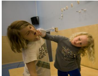
Figure 4. Two weather gods influencing each other’s movement space when doing a fake hitting action in the slow-motion dance.

events would make them become aware of the far-space. For example at one point the weather gods were looking only at each other but when hearing the loud ‘eat’-sound, meaning a fruit kid had collected a fruit card and had raised his/her energy level, they looked up at the fruit kids. Then one of the weather god girls tapped the other one of the shoulder, said something in a low voice where after they both started moving more intensely to generate more energy. Many weather god pairs also talked about waiting for the fruit kids to get new energy from fruit cards before they sent off a flash, showing how the interaction allowed them to stay aware of the surrounding environment, what was happening out on the fruit kids track, despite their at times deep dive into the movement and their personal sphere.