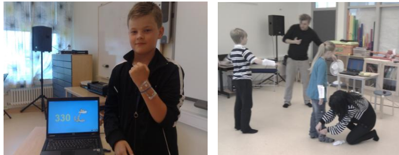
Figure 1. Workshop 2 (left) with fake sensor and wizard of oz prototype. Workshop 3 (right) attaching Wii Motes to arms and legs to detect movement and energy consumption

In the third workshop the children were equipped with real sensors that would actually estimate their energy consumption. Ten children in groups of two were equipped with Nintendo Wii Remotes, nicknamed Wii Motes, on one arm and one leg. While performing a number of exercises they were encouraged to hypothesize and think about the outcomes from the exercises they were undertaking: i) running vs. walking where the children would firstly eat a slice of apple and then either run or walk while observing on a computer screen the type of activity that “consumed” the eaten apple the fastest, ii) the children would operate a lamp and a fan, while observing which appliance would run the longest on the approximate energy amount found in the slice of apple they had previously eaten, iii) moving to charge a ‘smart battery’ while listening to audio and vibration as feedback, the children would try to find the movement patterns that triggered a rhythmic sound from the Wii Motes. In this workshop, as well as the previous one, the use of sensors, simple visualizations and exercises were not meant to provide the perfect setting nor the correct procedures for analyzing e.g. energy consumption in real life but were designed to spur discussions with the children about the subject energy.