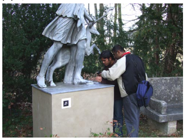
Figure 5. The Treasure: Two players getting a new quest from a statue.

At this point we gave them an overview of the Magic Lens Box, and let them ponder about the best way to implement their game. In the beginning the students had some problems understanding the difference between mobile and stationary containers . After getting examples, however, on how to use them best, the students quickly noticed that all the characters in the game (real statues) were best represented by stationary containers , while the items the players would have to use for solving the riddles became mobile containers (as these would be carried around by the players).