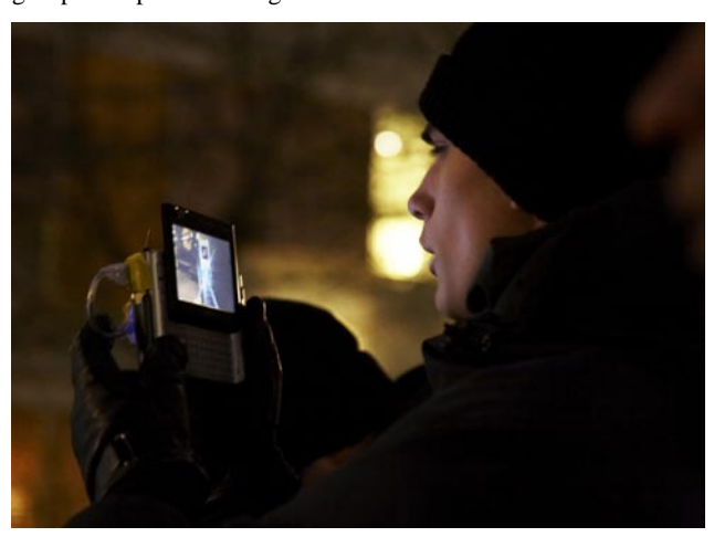
Figure 4. Interference: A player using the UMPC to map out the virtual network.

Additionally the sleek design of the UMPCs was seen as really fitting the setting of the initial game scenes. In some groups mapping out the network became a group effort with different players stating their opinion on where to go next, while in other groups one person with good orientation skills took the lead.