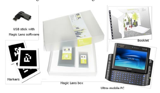
Figure 1. The Magic Lens Box (center) and its content (left and right)

Our two main objectives are somehow contradictory, since supporting a high flexibility in the design makes a system rather more complex and does not simplify it. To achieve the objectives stated above we had to cut down and limit certain aspects. During the iterative design we decided on a certain MR hardware system as well as on a certain set of interaction techniques that are the same for all the games based on the Magic Lens Box.