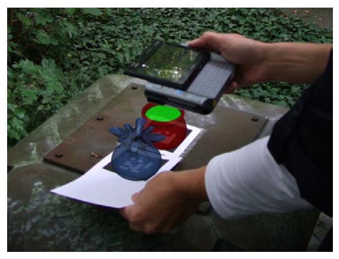
Figure 3. The Alchemists: A player puts an ingredient from the bag into the cauldron by using the basic interaction of the Magic Lens Box.

Especially the scoring process demanded that you could attach a rule to several game objects at the same time, something we had overlooked in the first design process for the Magic Lens Box and quickly implemented. It also proved very useful that instead of having to specify a concrete game object or property inside a condition or action of a rule , you could always instead automatically use the game object or property that invoked the rule .